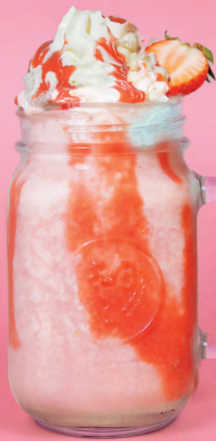
Strawberry & Coconut